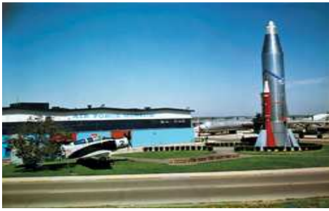
Figure 4 many of its artifacts were stored outside

First official house was built for the museum just before the depression and World War 2. In 1947 the Air Force was formed and the new museum was moved into a manufacturing plant. With a few exceptions, the Smithsonian became a museum for general aviation. The aircraft that was not usable was burned and destroyed.