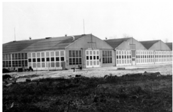
Figure 3 McCook Field

Charles Kettering got involved with McCook field bought by Daytonians for US Government. 1917-1923 used up a few planes and placed in hangars and became start of Air Force Museum and the research center in 1927.